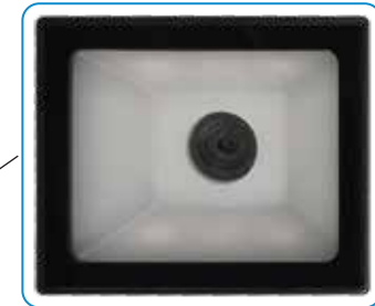
QR code scanner